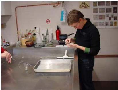
Measure the pH-value using indicator strips