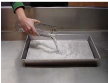
Add remaining water