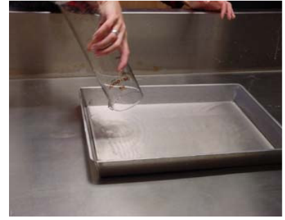
Add the prepared 1 L of calcium phytate solution to the tray