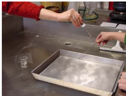
Add more Ammonium Hydroxide and check the pH