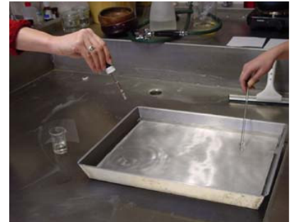
Add some Ammonium Hydroxide using a glass pipette, stir