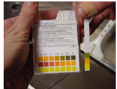
The final pH-value should be 5.5-5.8