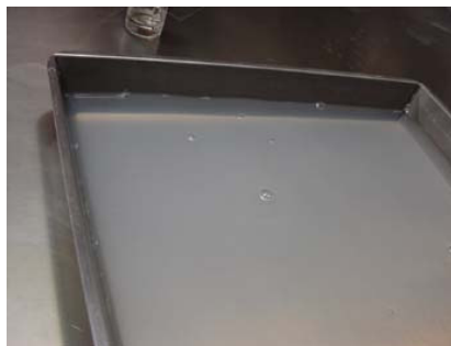
Calcium phytate is ready