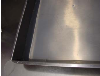
The solution is clear and colourless