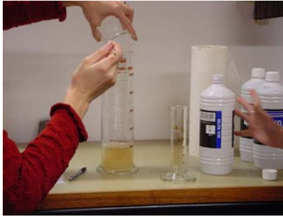
Pour the solution into a 1L beaker